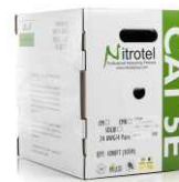
Nitrotel Cat 5E UTP Cable

** For standard cable colors add suffix BU (Blue), WH (White), BK (Black), GR (Green), RD (Red), GY (Gray) or YL (Yellow) after desired length at the end of the part number. For example, the part number for a blue 3 foot patch cord is NTPC5E03BU.